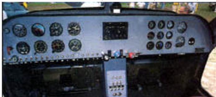
There's plenty of panel room in a Comp Air. This is in one of the piston-powered versions.