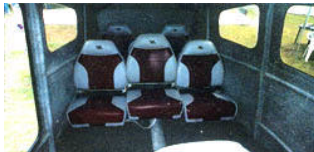
This model appears to accommodate eight passenger seats ... plus two for the pilots.