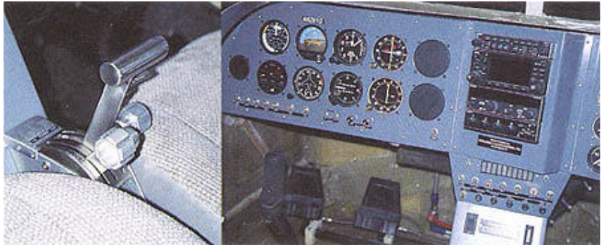
LEFT: Located on the engine quadrant of the Comp Air 10's instrument panel are fuel, prop and power controls that are only slightly different from those found in an aircraft with a piston engine. RIGHT: Designers at Aerocomp reconfigured the panel of the Comp Air 10 XL to make it easier for the pilot to attend to the instruments.

Next, I asked if I could visit the customer construction area, because I wanted to see how new Comp Air owners and pilots were doing building their own aircraft on site. The place was huge! When I said I never expected it would be this