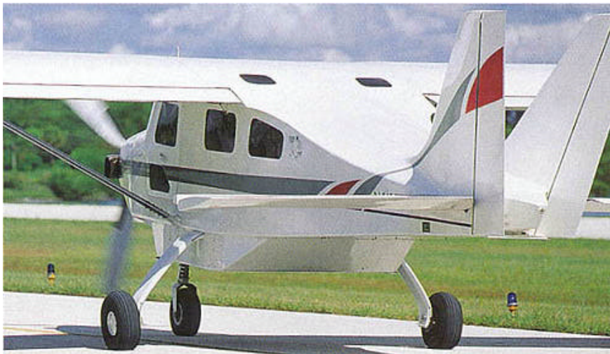
The Comp Air 10 uses twin vertical stabilizers to keep the overall height and length of the fuselage smaller for storage in average-size hangars.

Soon after takeoff, the pilot turned the controls over to me, and I kept climbing to the location where we'd prearranged to rendezvous with the Comp Monster. Hurricane Dennis had been wreaking havoc with the weather all along the coast that week, but it also left a variety of gorgeous medium-size clouds for us to use as photographic backgrounds. As I flew along, the plane's handling reminded me of a 600hp deHavilland Otter I'd once flown,