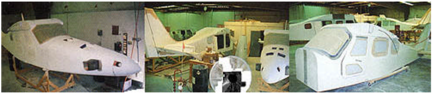
ABOVE LEFT: The owner of this aircraft is current/y working on the final details of the fuselage. ABOVE CENTER: This well-run facility, housed in a big warehouse-type building adjacent to the airport, is sub-contracted by Aerocomp. ABOVE RIGHT: During our visit to the facility, at least 10 owners were assembling their aircraft under the supervision and guidance of experienced aircraft-construction instructors.

while also an excellent engine, is not certified. If you want to install a Walter engine in your homebuilt, I suggest you buy the one you can best afford.